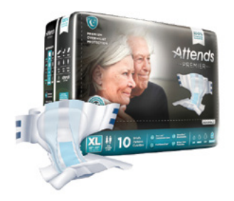
Premier® Adult Briefs, X-Large - 58" to 63" Item No. 1995