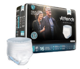
Premier® Disposable Underwear, Large - 44" to 58" Item No. 1991