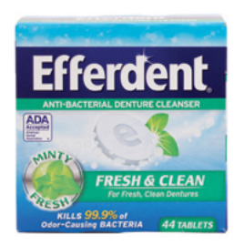
Efferdent® Plus Mint Tablets Item No. 1653