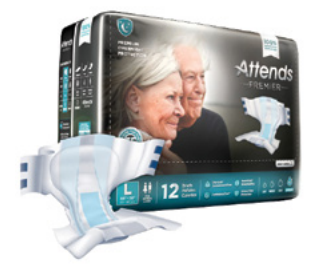
Premier® Adult Briefs, Large - 44" to 58" Item No. 1994