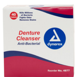
Denture Cleaning Tablets Item No. 1032