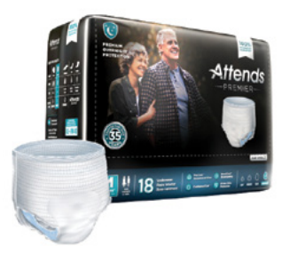
Premier<sup>®</sup> Disposable Underwear, Medium - 36" to 44" Item No. 1990