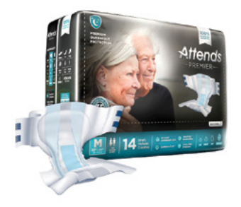
Premier® Adult Briefs, Medium - 32" to 44" Item No. 1993