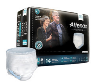
Premier® Disposable Underwear, X-Large - 56" to 68" Item No. 1992